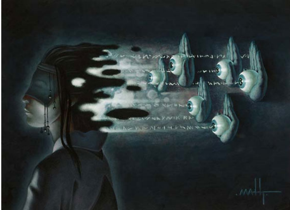
Evermind final art by Matt Thompson

An interesting addition here in the final art is the blindfold over the jushi's eyes -- an indication of the mage's "automatic" (i.e., non-spellcasting) learning.