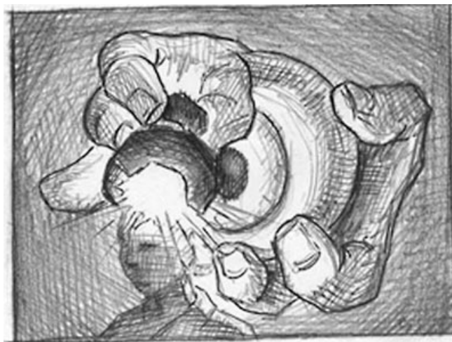
Evermind sketch 2 by Matt Thompson